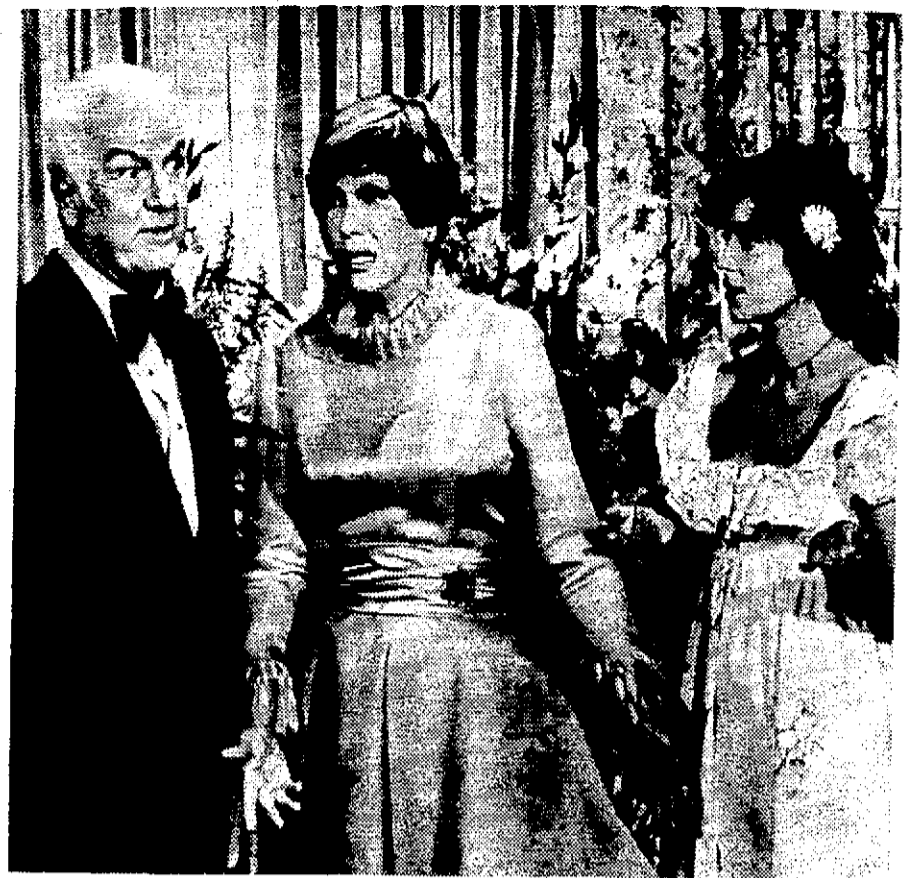
Don Porter, Eve Arden and Jennifer Salt star in "Mother of the Bride," 1:30 p.m., Jan. 9, ABC-TV.

"This place is a mess. I wish we could find a good cleaning man."